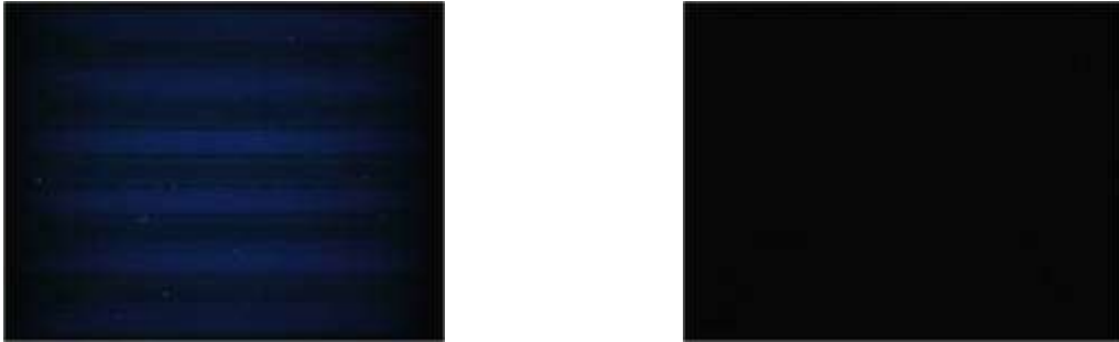
Fig. 1: UV light source of a conventional device (left) and the BT Lab System UV Transilluminator (right)

BT Lab Systems UV Transilluminators have innovated special black glass that blocks all visible light and allows only UV light to pass through, which helps reduce background illumination from visible light (Figure 1). The use of the special glass makes the UV transilluminators appear as if it is not working when turned on as researchers are expecting to see the purple glow typically associated with older models.